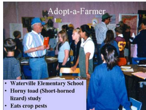
Students, professionals, and community linked by a local lizard

Water quality and restoration data from schools as well as research groups adds to the understanding of land use, fish and wildlife habitats.