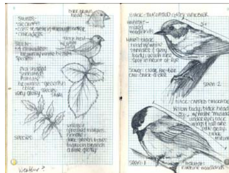
Field notebook created in a School of Tacoma Arts NatureMapping project

Become a citizen scientist and a valued volunteer partner with the scientific community and the private sector. Contact a local Activity Center and ask if they are or want to become NatureMapping certified and get involved in small research projects or become a NatureMapper on your own.