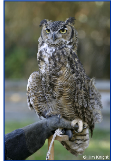
Great Horned Owl Photo